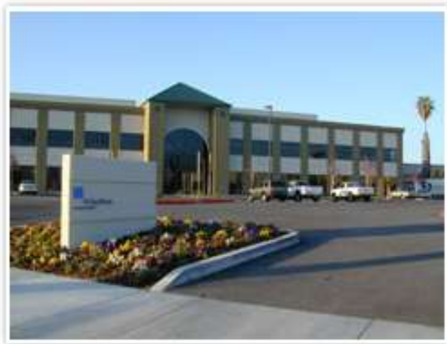
Corporate Headquarters: Santa Clara, CA